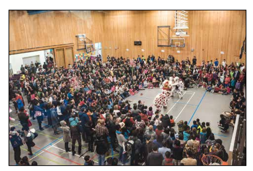
Record attendance at the 2018 Lunar New Year celebration at Wesbrook Community Centre.

March 21 is the Nowruz Persian New Year, and some Iranian residents will prepare a Haft Seen display at Wesbrook and The Old Barn Community Centres and present traditional Persian food at the Let's Cook Club. A community resident from