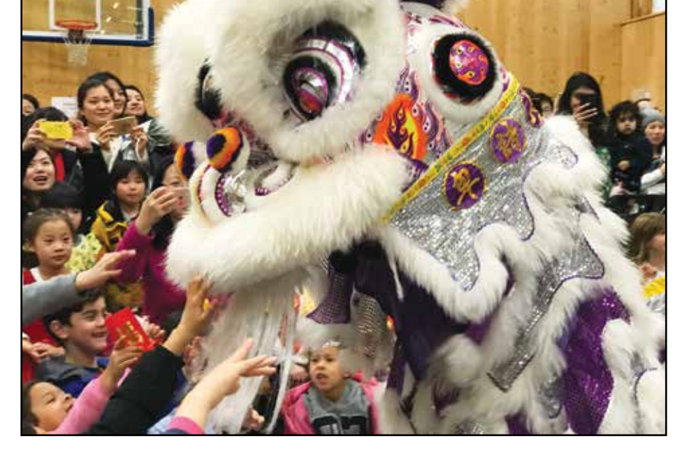
Lion Dancers are welcomed in the Year of the Dog in the Wesbrook Community Centre.

Volunteers from the Let's Cook Club demonstrate Chinese tea ceremonies.