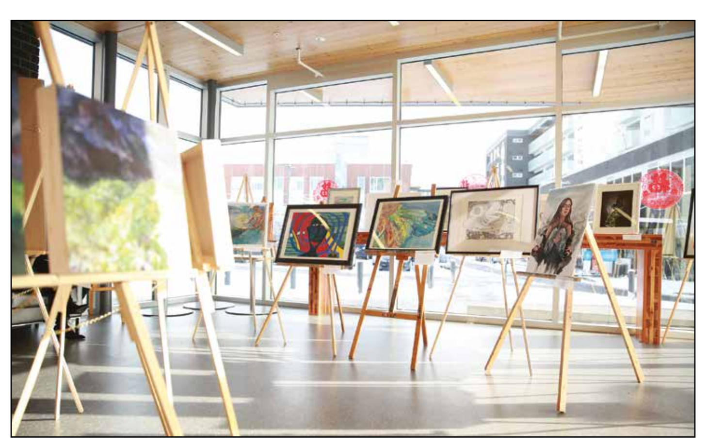
UNA Art Expression Youth Club exhibition at Wesbrook Community Centre.

This was not a simple task in any way, shape or form. We reached out to every youth artist we knew, visited over ten schools in the Lower Mainland to publicize our exhibition through handing out posters and getting in touch with various art departments, and pushed our limits to the maximum by creating a few more pieces of work ourselves. It was especially difficult when last-minute emergencies regarding easels inevitably came up a day or two before the exhibition. Our members all squeezed out time from our tight schedules