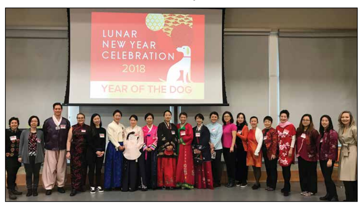
Adult Volunteers and UNA staff.

In China, guessing lantern riddles is an essential part of the Lunar New Year Festival. On the 15th and last days of the Lunar New Year Festival, a Lantern Festival is held in the community, park or public market. Riddles are written on paper slips and attached to the lanterns. Festival goers work to solve the riddles, pulling the papers out and checking their answer