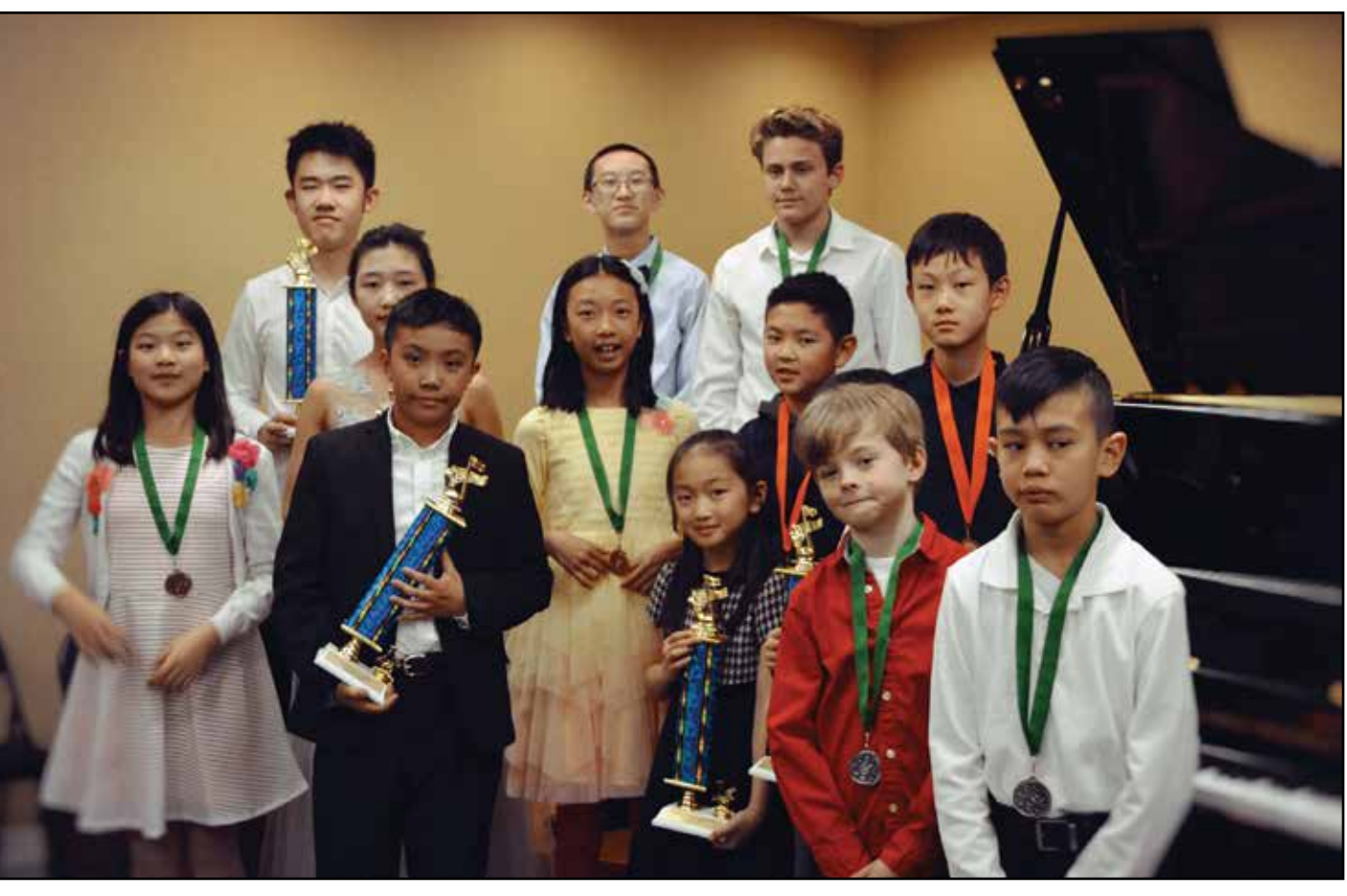
The winners of the annual Piano and Strings Competition at Mozart School of Music Vancouver were celebrated at the Awards Concert on March 3.

Concerto is a music written for a soloist and orchestra. For our competition, each student prepared one or more movement(s) of a concerto and/or solo piece for strings with piano. All the orchestral parts were performed on a second piano by the students' teachers or accompanists. We had beautiful piano, violin and guitar playing, and we enjoyed listening to the works by classical composers such as Vivaldi, Mozart, Haydn, and Saint-Saëns. We also