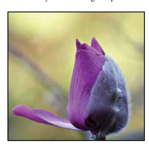
Magnolia campbellii 'Borde Hill' blooms at UBC Botanical Garden in a previous season. Don't miss this stunning sight this year.

On that date, the Greenheart TreeWalk plants to the Garden Centre and are expectwill officially open for the season, and our ing more over the coming weeks. Check Shop in the Garden and Garden Centre will switch to longer hours. The Shop will be open from 10 am to 5 pm every day. We have already received large shipments of