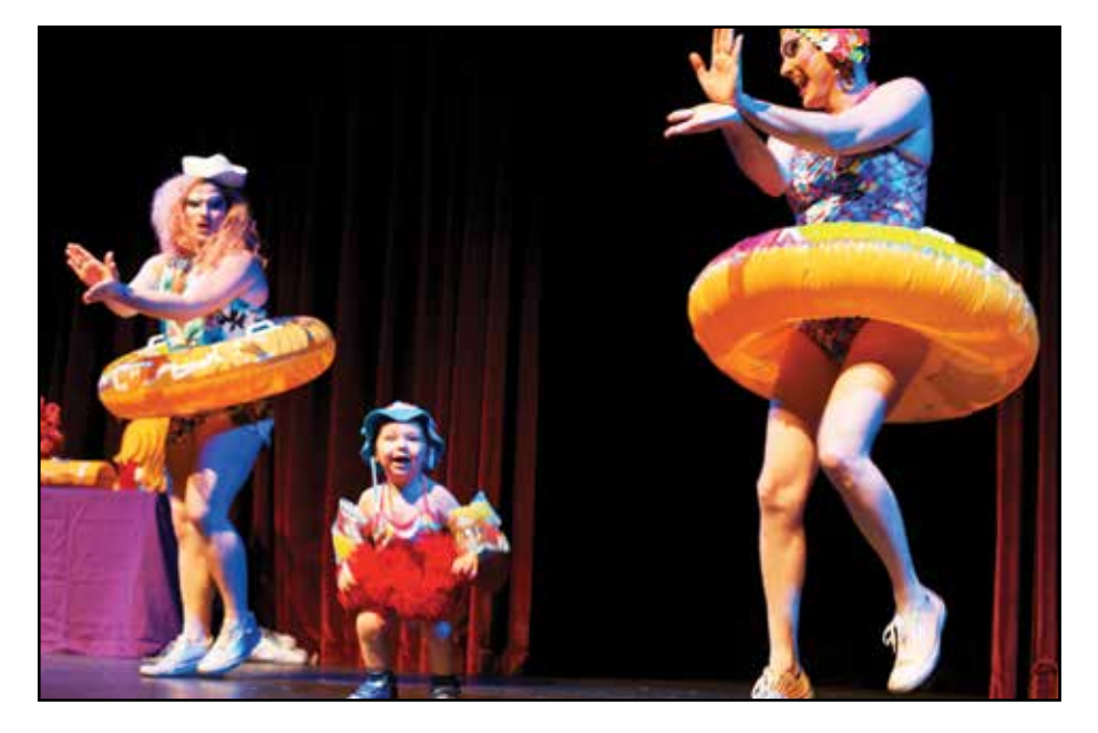
An incredibly silly and fun performance, Parents Are a Drag, at the Frederic Wood Theatre.

All in all, Kids Take Over UBC gave a chance for children of all ages to experience the inspiring place that many of us adults take for granted in our day-to-day lives. Now that many of us are spending most of our time at home, we realize how lucky we are to live, work and play at UBC, one of the most beautiful places in the world. Soon enough, we will all, adults and children alike, be able to take over the campus again. In the meantime, visit www.utown. ubc.ca to check out our photos, video and ideas to keep creative and having fun while we hunker down at home and keep everyone healthy and safe.