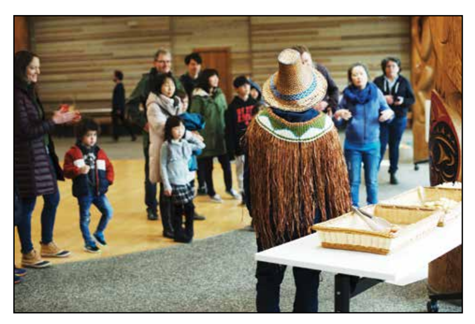
Families learning about stories and history of the land on which they stand at the First Nations Longhouse.