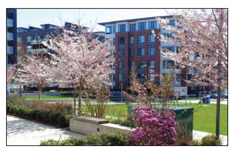
Spring in University Neighbourhoods

The revised UNA Constitution and Bylaws and the UNA–AMS Memorandum of Agreement are available in the Agenda package for the open UNA Board meeting.