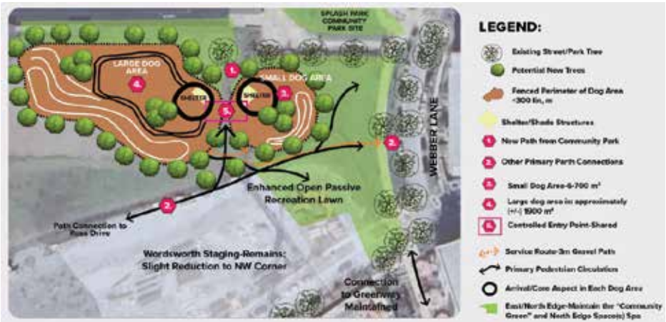
The plan for the proposed Wesbrook dog park.

“I have heard an increased number of concerns over the past 1-2 years,” said Jen McCutcheon, the elected director of Metro Vancouver’s Electoral Area A—which includes UBC’s Point Grey campus.