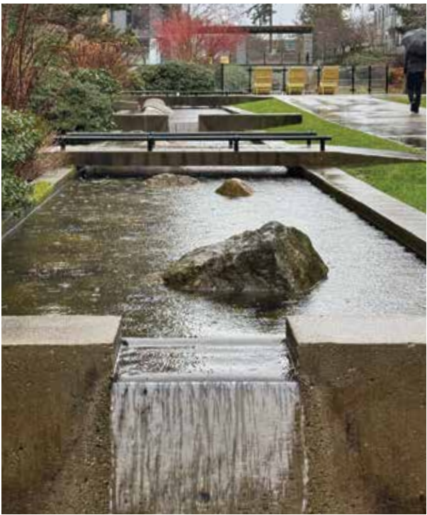
UBC Properties Trust says there are no more "major" leaks after repairs to the Webber Lane waterway, pictured here last month.

Clockwise from top left: Slime mold Lycogala epidendrum, common name wolf's milk, observed in Pacific Spirit Regional Park; A barred owl observed in Pacific Spirit Regional Park; Fungus in the genus Mucronella observed in Pacific Spirit Regional Park.; Hair ice, produced by the fungus Exidiopsis effusa, observed near Norma Rose Point.