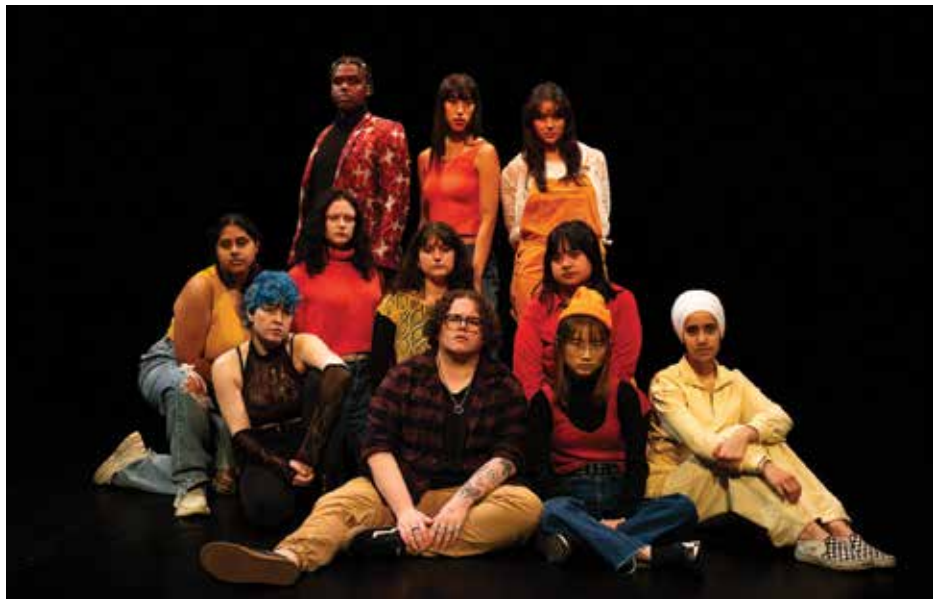
Cast members of the UBC Theatre and Film production, The Arsonists .

(UBC Theatre and Film's final production of the 2024/2025 season, The Last of the Pelican Daughters , is onstage at the Frederic Wood Theatre from March 19-29.)