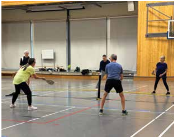
Recreational and culture programming fees - the UNA's second largest revenue source - are estimated at $1.6 million for 2025-26, which is a slight increase from $1.5 million in the 2024-25 budget.

The budget is now expected to go to the UBC Board of Governors, and the university will assess whether expenditures are in line with stipulations of the Neighbours Fund.