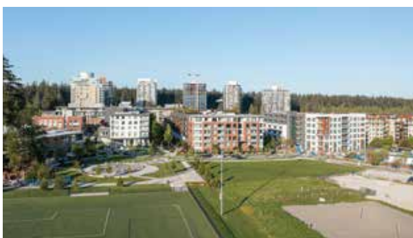
The site of a proposed off-leash dog park, located in the area between Ross Drive and Webber Lane, north of Birney Ave.