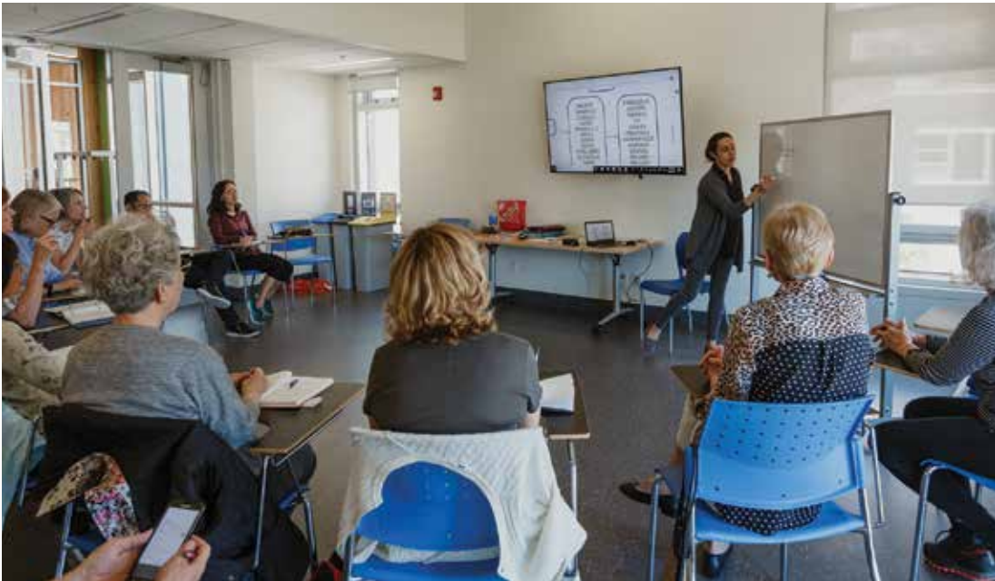
Students, and maybe a few “lifers”, at a UNA language class.

“Learning can happen, and should happen, at any and every age.”