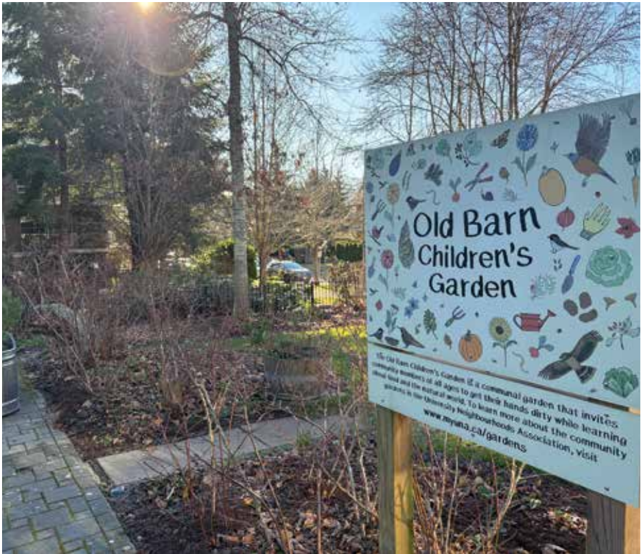
The Old Barn Children’s Garden.