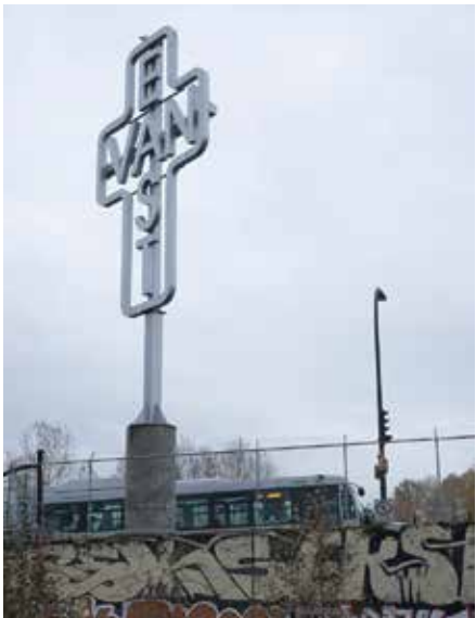
The East Van Cross.