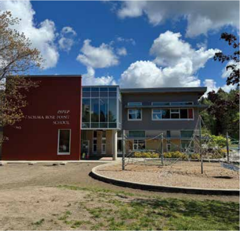
The Norma Rose PAC is currently working with the Vancouver School Board to plan and build an intermediate playground for 4th-7th grade students, which would complement the existing playground that's currently available for kindergarten to 3rd graders only.

said the project hasn't been paused, and the computers were purchased with separate funds. Existing funds raised by the PAC for the playground have been set aside in a separate account, she added.