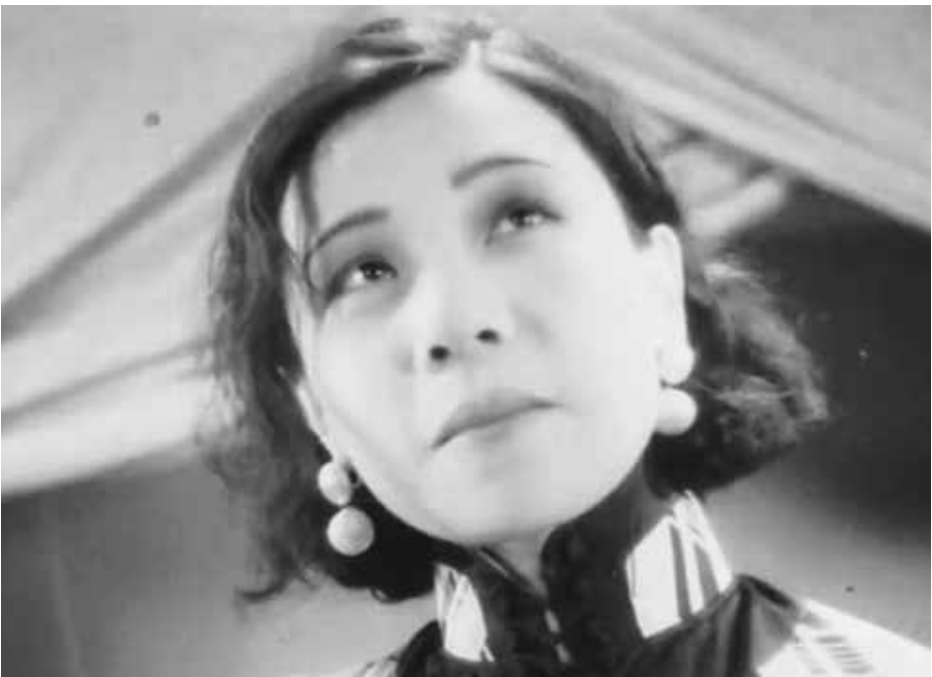
Ruan Lingyu, the star of Goddess (1934).

China’s answer to Gone with the Wind is a two-part, three-hankie wartime melodrama that broke box office records. An all-star cast dramatizes the depravities and human costs of war through an epic story of one family torn apart.