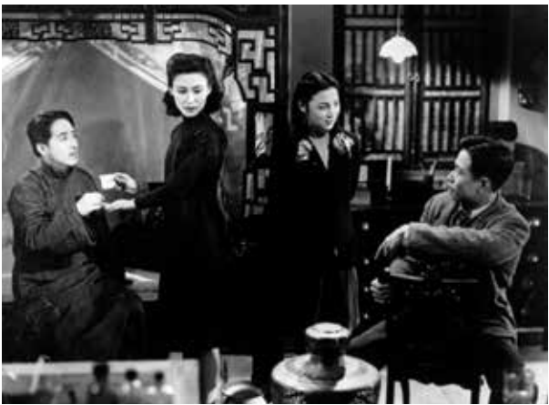
A scene from Spring in a Small Town (1948), widely regarded as the best Chinese film of all time.

被广泛认为是中国影史上最伟大的影片，费穆执导的这部作品以纯粹的电影诗篇，讲述战争废墟中的失落与重生。