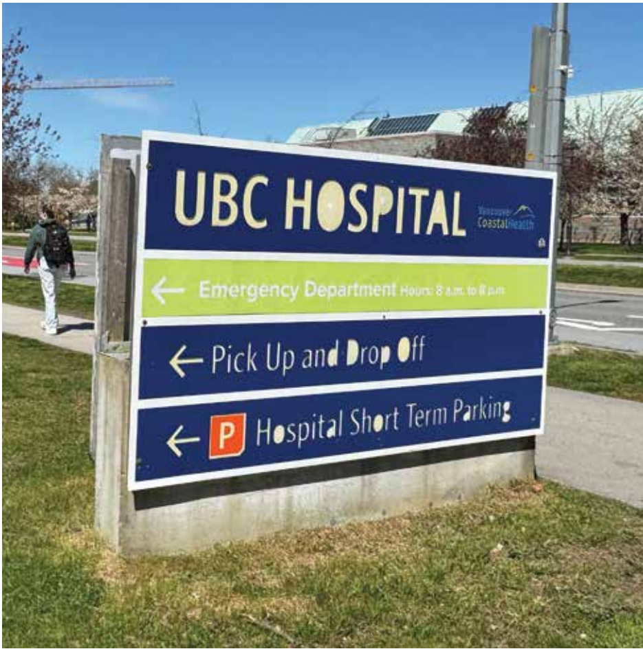
UBC Hospital. (Photo: Emmanuel Samoglou).

How much longer can we afford to ignore this prob-