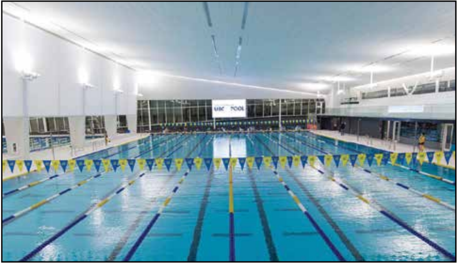
UBC Aquatic Centre.