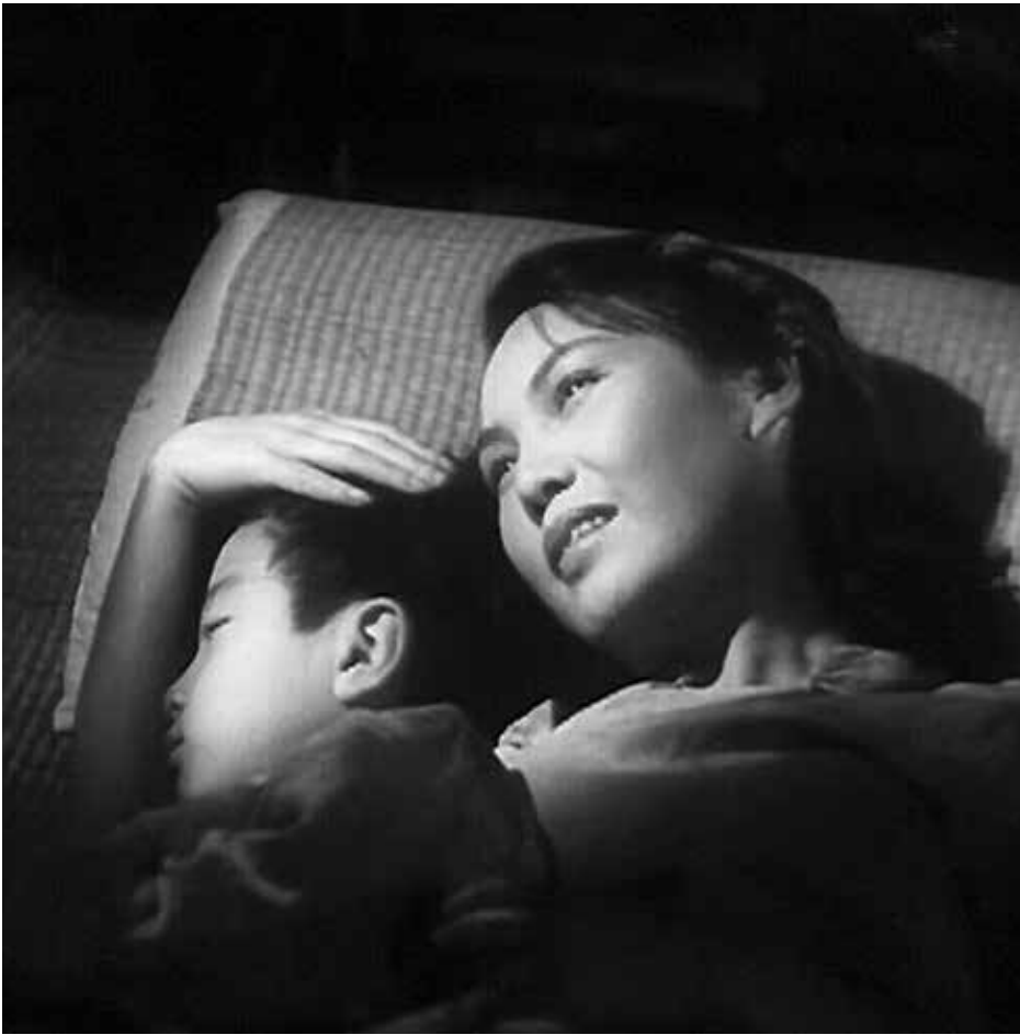
The film Spring River Flows East (1947) is regarded as China’s answer to Gone with the Wind .

The earliest surviving full Chinese-made film is a silent slapstick comedy about a carpenter in love who uses the tricks of his trade to get the girl. Watch for gags inspired by Hollywood silent comedians Buster Keaton and Harold Lloyd.