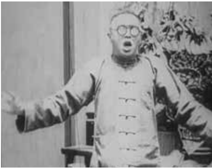
A scene from Laborer's Love (1922), the earliest surviving full Chinese-made film.