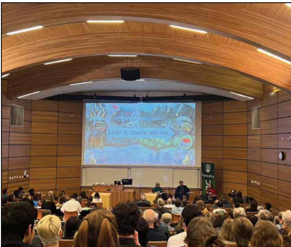
Panelists at a recent campus event said humans must adapt and learn to co-exist with more frequent and intense wildfires.