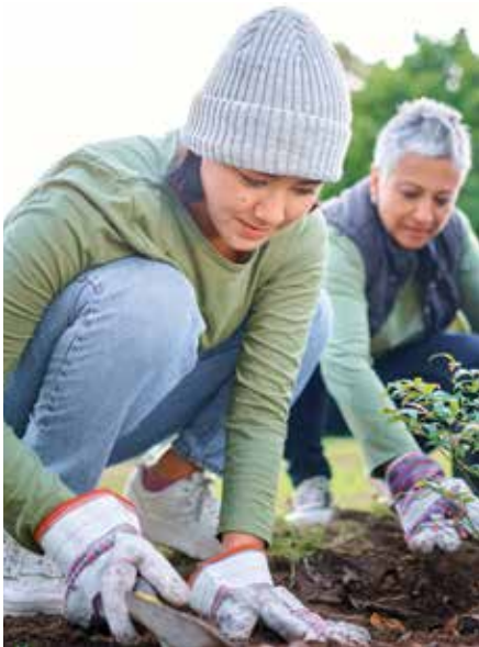
UBC Farm offers two volunteer programs for youth interested in sustainable agriculture.

UBC Farm offers a variety of volunteer opportunities for those who like getting their hands dirty growing things. The farm, adjacent to the Wesbrook Place neighbourhood, is a certified organic, mixed vegetable farm engaged in research, food production, and education. The farm's two main volunteering programs - Busy Bees and Humble Harvesters - are open to volunteers aged 14 and up. (Younger volunteers are welcome if accompanied). Busy Bees is for volunteers who can commit to multiple shifts per month. Humble Harvesters is for people who prefer the flexibility to sign up for occasional shifts.